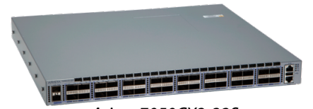
Arista 7050CX3-32S: 32x 100G QSFP100 ports, 2 SFP+ ports

The 7050CX3-32S is a 1RU system with 32 100G QSFP ports offering wire speed throughput of up to 6.4 Tbps bi-directional. Each QSFP port supports a choice of 5 speeds with flexible configuration between 100GbE, 40GbE, 4x10GbE, 4x25GbE or 2x50GbE modes for up to 128 ports of 10GbE and 25GbE or 64 ports of 50GbE. All ports can operate in any supported mode without limitation, allowing easy migration from lower speeds and the flexibility for leaf or spine deployment.