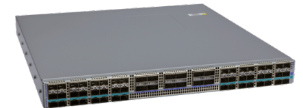
Arista 7050SX3-48YC12: 48x 25G SFP and 12x 100G QSFP ports

The Arista 7050SX3-48YC12 is a 1RU system with 48 ports of 25GbE SFP and 12 ports of 100GbE QSFP with an overall throughput of 4.8 Tbps. The high density SFP ports can be configured in groups of 4 to run either at 25G or a mix of 10G/1G speeds. The QSFP ports allow for a choice of 5 speeds including 100GbE, 40GbE, 4x10GbE, 4x25GbE or 2x 50GbE with a wide choice of transceivers and cables enabling a choice of combinations for both leaf and spine deployment. With low latency and no oversubscription, the switch is optimized for high performance server and storage deployments.