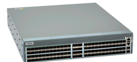
Arista 7050SX3-96YC8: 96x 25G SFP and 8x 100G QSFP ports

The Arista 7050SX3-96YC8 is a 2RU system with 96 ports of 25G and 8 ports of 100G with an overall throughput of 6.4 Tbps bi-directional. The high density SFP ports can be configured in groups of 4 to run either at 25G or a mix of 10G/1G speeds. The QSFP ports allow for a choice of 5 speeds including 100GbE, 40GbE, 4x10GbE, 4x25GbE or 2x 50GbE with a wide choice of transceivers and cables enabling a choice of combinations for both leaf and spine deployment. With low latency and no oversubscription, the switch is optimized for high density server environments with native 25G connections.