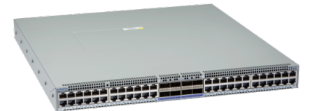
Arista 7050TX3-48C8: 48x 10GBaseT and 8x 100G QSFP ports

The Arista 7050SX3-48C8 and 7050TX3-48C8 are 1RU systems with 48 port of 10G and 8 ports of 100G with an overall throughput of 2.56 Tbps. The SX3 high density 10G ports can be configured for a mix of 10G/1G speeds to facilitate mixed connections and the TX3 RJ45 ports allows both 1G and 10G speeds. The QSFP ports allow 100GbE or 40GbE as network uplinks, with a rich choice of transceivers and cables for both leaf and spine deployment. With no oversubscription, the switch is optimized for high performance deployments with consistent features.