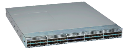
Arista 7050SX3-48YC8: 48x 25G SFP and 8x 100G QSFP ports

The Arista 7050SX3-48YC8 is a 1RU system with 48 ports of 25G SFP and 8 ports of 100G QSFP with an overall throughput of 4 Tbps. The high density SFP ports can be configured to run either at 25G or a mix of 10G/1G speeds. The QSFP ports allow for 100GbE or 40GbE as high speed network uplinks, with a wide choice of transceivers and cables enabling a choice of combinations for both leaf and spine deployment. With low latency and no oversubscription, the switch is optimized for high performance server and storage deployments.