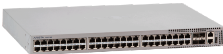
Arista 7010T-48: 48 port 10/100/1000 and 4 port 10GbE Switch

Consuming under 52W the 7010T are extremely power efficient at less than 1W per port. Built in power redundancy and customer reversible redundant fans allows cooling airflow in either forward or reverse direction in a single system.