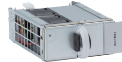
Arista 7010T hot swap and reversible fan module