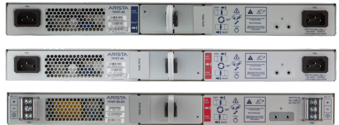
Arista 7010T Rear View - reversible airflow, AC & DC